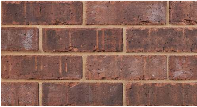
RIDINGS WEATHERED BLEND

Carlton's Developer Range includes five products that are widely used for contemporary brickwork in modern housing developments. Designed for use throughout the UK, they complement a vast array of vernacular architecture.