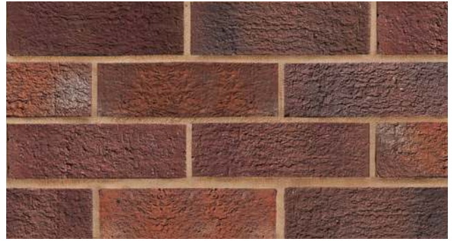
WOLDS MINSTER BLEND